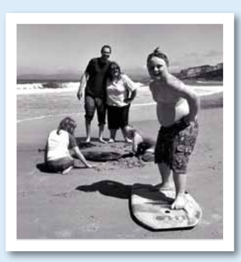
The Cooke Family, Dunedin