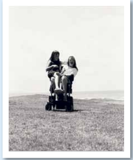
Brezze & Skylar, Auckland