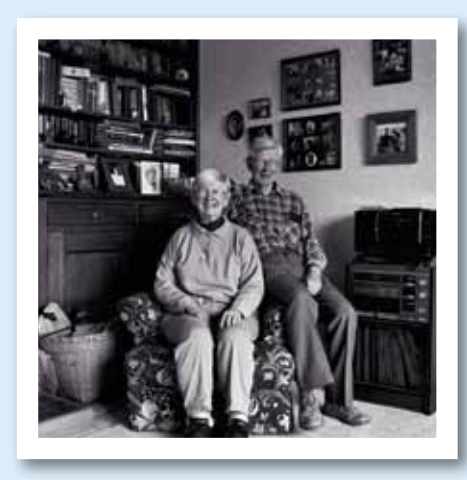
The Cassies, Otago