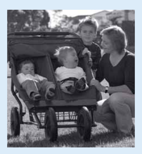
The Whittingtons, Auckland